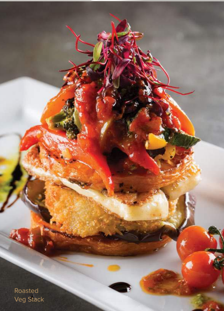
Roasted Veg Stack